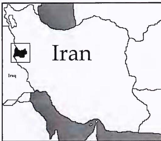
Figure 1. Location of Kermanshah province on the Iranian Plateau.

Key words. - Lacertidae, Eremias , Eremias (Eremias) montanus , Western Iran, Zagros Mountains, Kermanshah province, Siah-Darreh